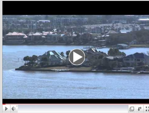
The Coastal Spine

It is not a matter of IF, but WHEN a hurricane hits the upper Texas coast and brings a deadly storm surge. The Houston Northwest Chamber of Commerce Board of Directors has passed a resolution in support of the development of the Coastal Spine. View the VIDEO: